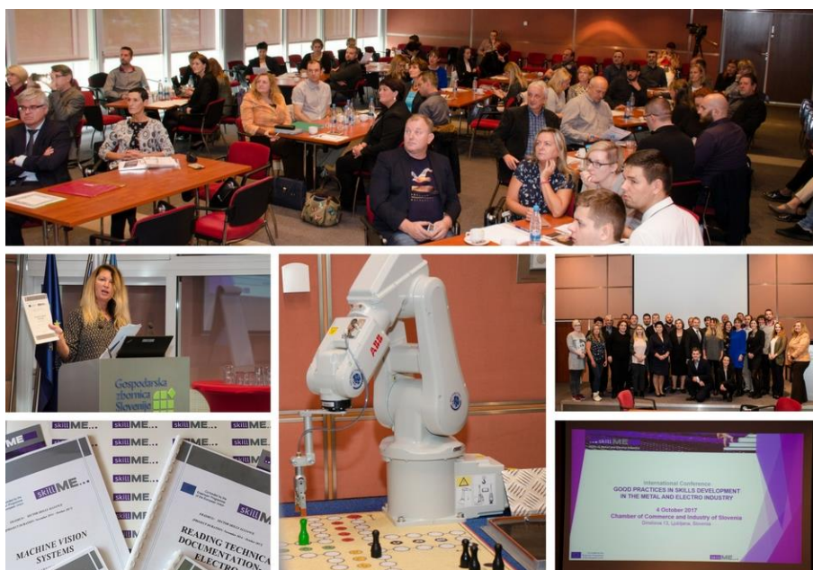
The international skillME conference was hosted on 4 October 2017 in Ljubljana, Slovenia.

The purpose of the conference was to present good practices and innovative approaches in filling skill gaps, matching skills with labour market needs, developing new skills for new jobs and adapting national strategies in order to improve the quality and efficiency of vocational education and training and increase the competitiveness of workers. Various approaches to strengthening VET in the participating countries of Slovenia, Slovakia, Latvia and Croatia and national strategies for implementing the curricula designed within the skillME project into national VET frameworks have been presented. In addition, trainers and students presented their concrete experience with pilot trainings implementation and demonstrated the usability of the trainings and results based on the Machine Vision training – camera usage for robot control, presented by students of the Secondary Technical School Stará Turá. More information on the conference can be found on the project website .